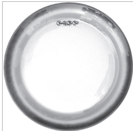
A plate from the Cerrito City Club, an institution in town for many years.