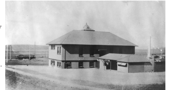
A Streetcar rolls north past the original Fairmont School

For this reason, a number of very important war-related services operated out of Fairmont School. Ration books for meat, sugar, gasoline, coffee, and so on were