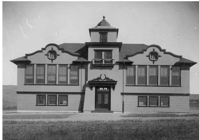
Looking east from San Pablo Ave. at the original Fairmont School accommodate a growing population. The first meeting of the El Cerrito Trustees (City Council) was held at Fairmont School.

Fairmont quickly became more than just a school. Although early pictures show that it was surrounded by farms and fields and very few houses, it was a beacon and a social center for the farmers and settlers of the area. It served the children and farm land community for miles around. Students attended from areas that in later days, and with the application of a few artificial lines drawn on a map, would be called El Cerrito, Kensington, and Richmond. These "naive" young students considered themselves to all be part of the same community. The original Fair-