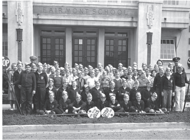
The crossing guards pose in front of the second Fairmont School

principal and a full time secretary. There were no longer farm lands and empty space surrounding the school; instead there were homes and businesses. San Pablo Avenue was a busy State Highway. Crossing guards and traffic boys protected the busy crosswalks. Fairmont was unique in that it had both crossing guards to protect children crossing the local streets and also crossing