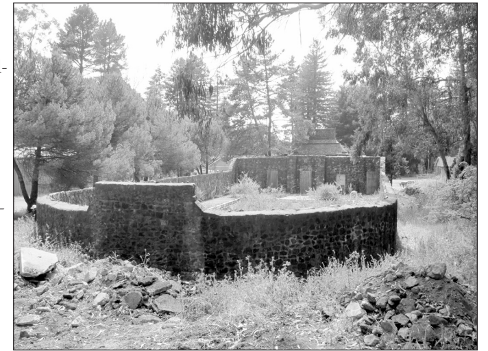
Stone walls built by the WPA enclose the old swimming pool

Camp Herms is on James Place, just above El Cerrito’s Arlington Park.