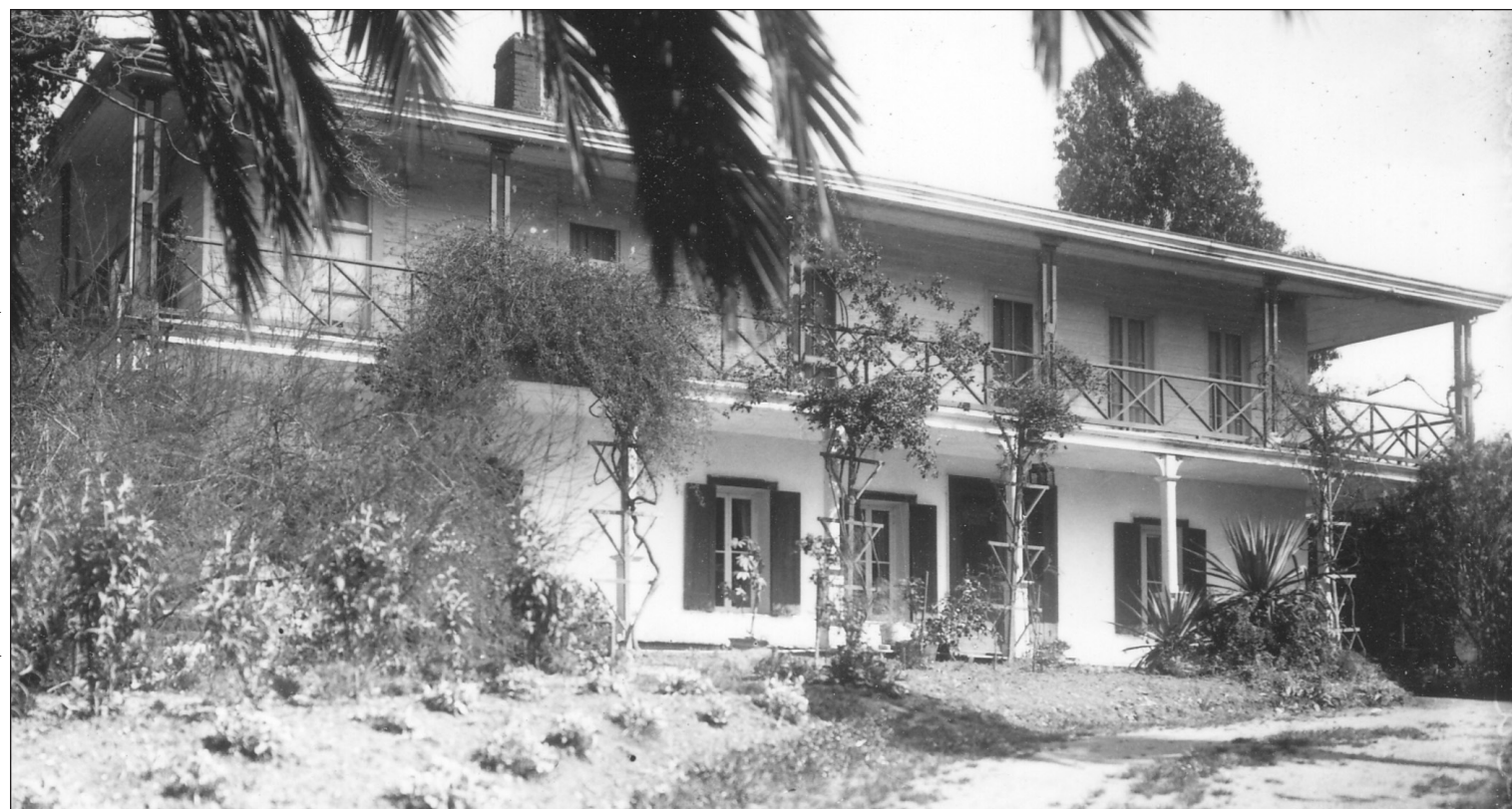
The Castro Adobe ca. 1890