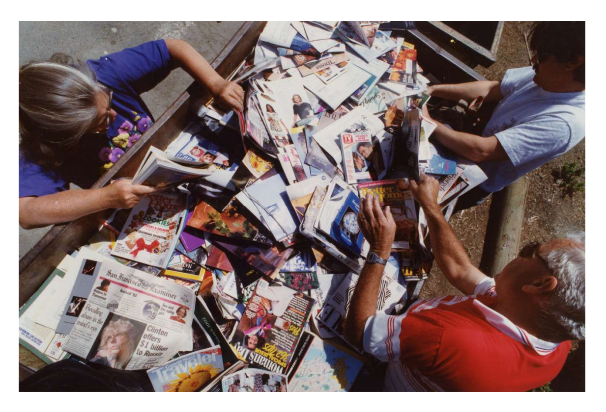
EAGER READERS have always flocked to the magazine bin for anything from Woman's Day to 1930s cinema magazines from Czechoslovakia. West County Times archive 1993.