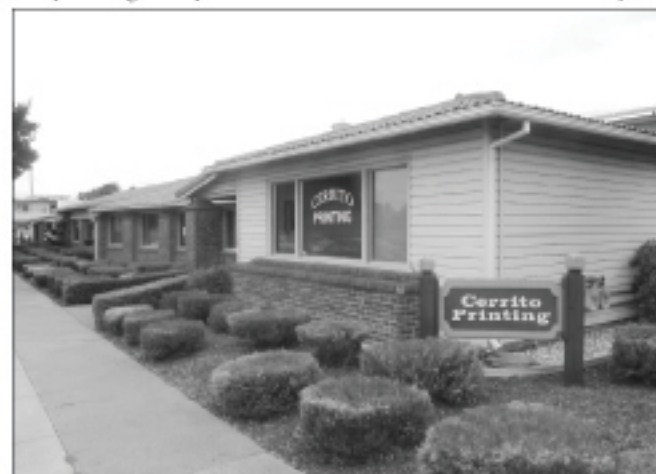
The former Cerrito City Club

Former Poloni's Market , now Giovanni's Produce , 1600 Liberty Street. Unpretentious, though not unprepossessing store that recalls the days when this district was Little Italy. Originally the retail outlet for Baroni bakery faced onto Liberty, with the bakery in a separate building in back.