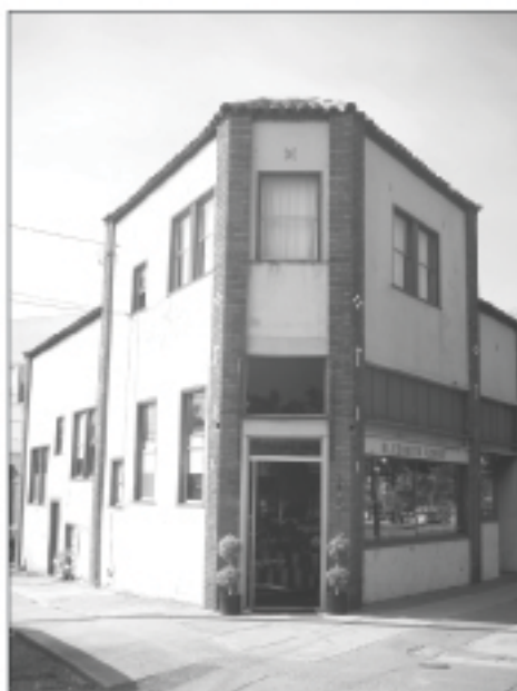
The Rossi building