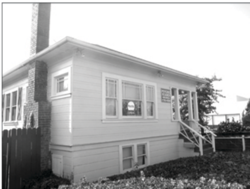
11471 San Pablo Avenue

Cluster of early 20th century houses. 11453, 11457, 11471 San Pablo Avenue, all circa 1905-1915. All of these buildings were at one time private homes but some of them have now been converted to shops.