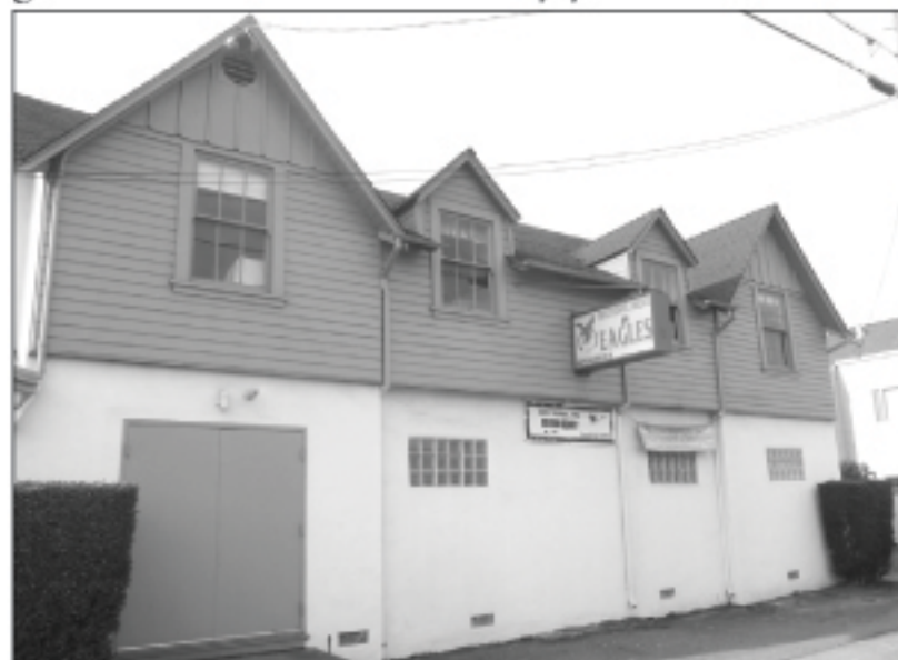
Eagles Hall, formerly the famous "Wagon Wheel"