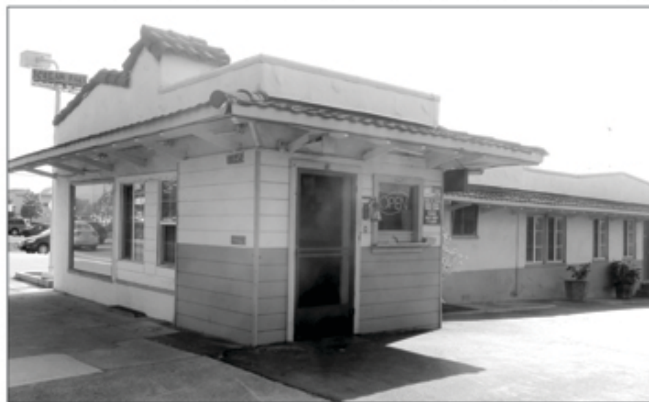
The Freeway Motel

Avenue. It began in 1931 as roadside cabins that catered to travellers on US 40. It is one of the earliest such travelers' accommodations in the area. Expanded over the years, the current structure went up about 1951.