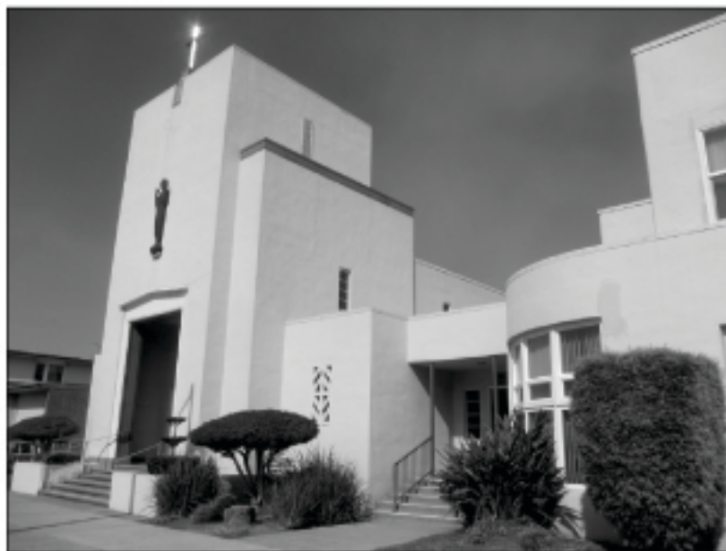
Saint John the Baptist Catholic Church