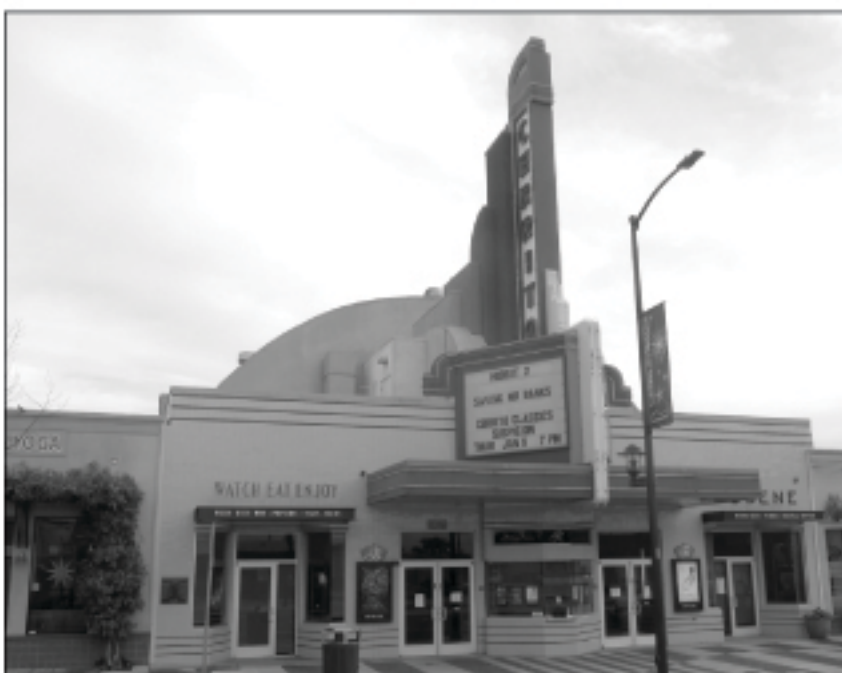
The Cerrito Theater