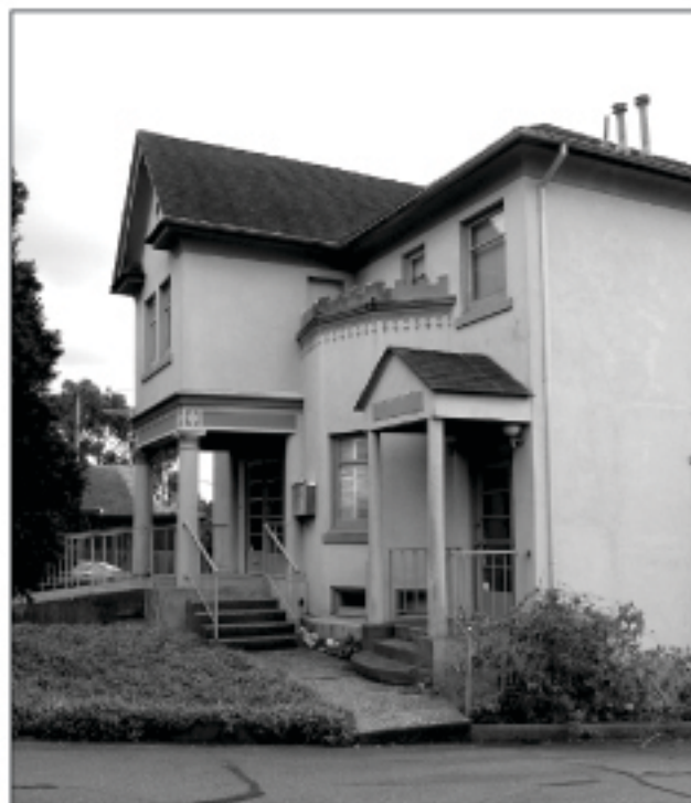
The Allinio house

Historic bungalow, 10152 San Pablo Avenue. One of a handful of early 20th century homes on the Avenue that retain their original appearance. Circa 1916. House shows typical dual-gable look of California bungalow.