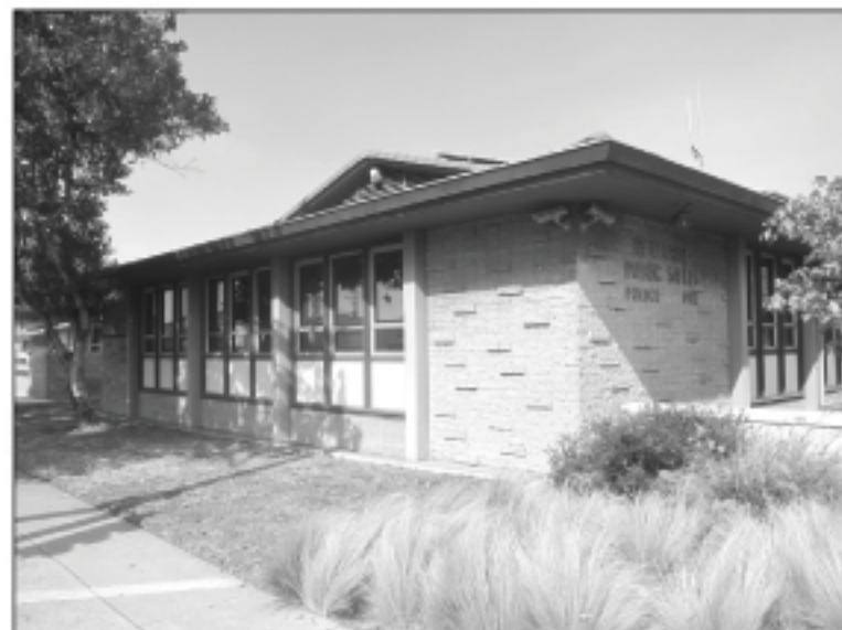
El Cerrito's Public Safety building

nants of the large and successful Japanese flower growing industry that flourished in north El Cerrito and Richmond.