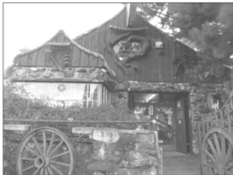
The Old West Gun Room

dustry workers, and the El Cerrito Motor Movies, a drive-in. El Cerrito Plaza opened in 1958, two years after the adobe was destroyed by fire.